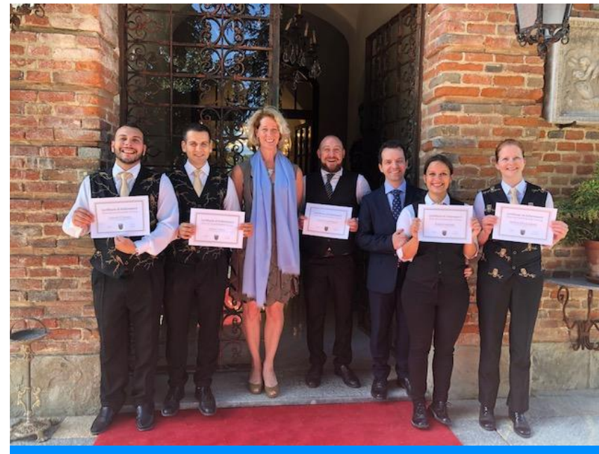
Photo taken on Polo & Tweed Training with Castello di Casalborgone, Italy

With limited time, our clients come to us for a full range of training services, from off the shelf training through to fully bespoke packages created around the specific property needs.