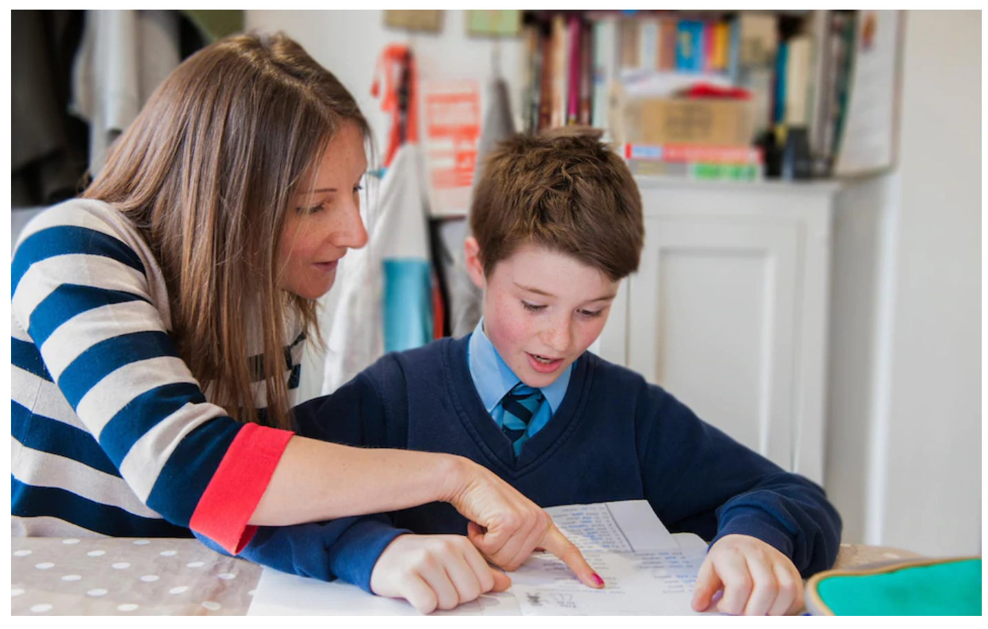
Home-schooling has become the norm

Families with young children were particularly affected. In pre-Covid days, children of the wealthy would have had a full day of school followed by revision (supervised by a nanny or housekeeper) and possibly one or more face-to-face tutoring sessions. In the first lockdown this changed overnight and the same children ended up stuck in front of a screen with only a harassed mother - who might have a job to do herself - to supervise.