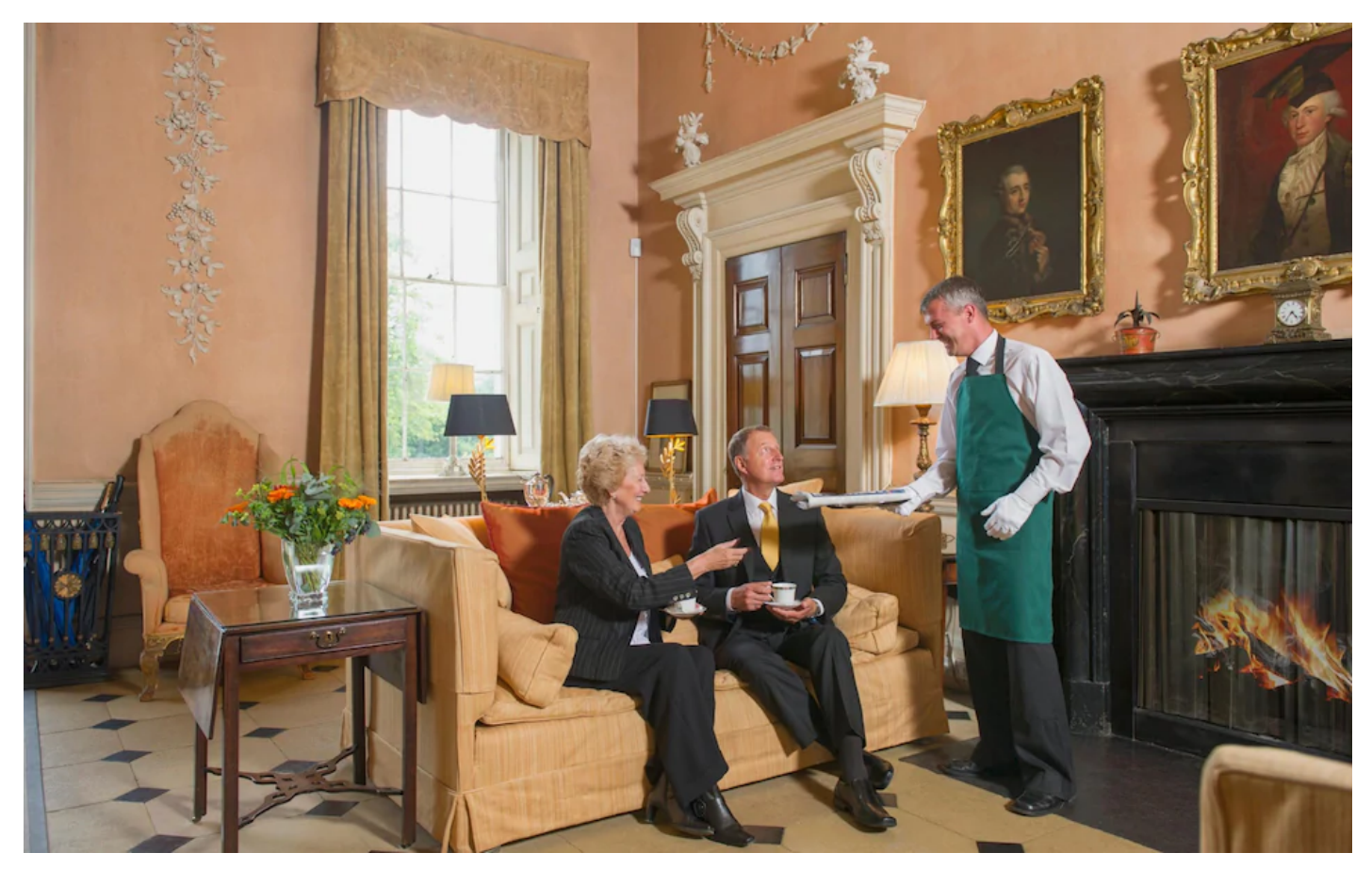
The very best household staff can command significant salaries

As soon as the first lockdown was over she called her usual top agencies to seek a replacement but was taken aback by the applicants. "Both agencies seemed to send us the dross," she says. "We eventually complained and both agencies sent us more appropriate candidates." The salary for a housekeeper working a 40-hour week is now in excess of \pounds 45k.